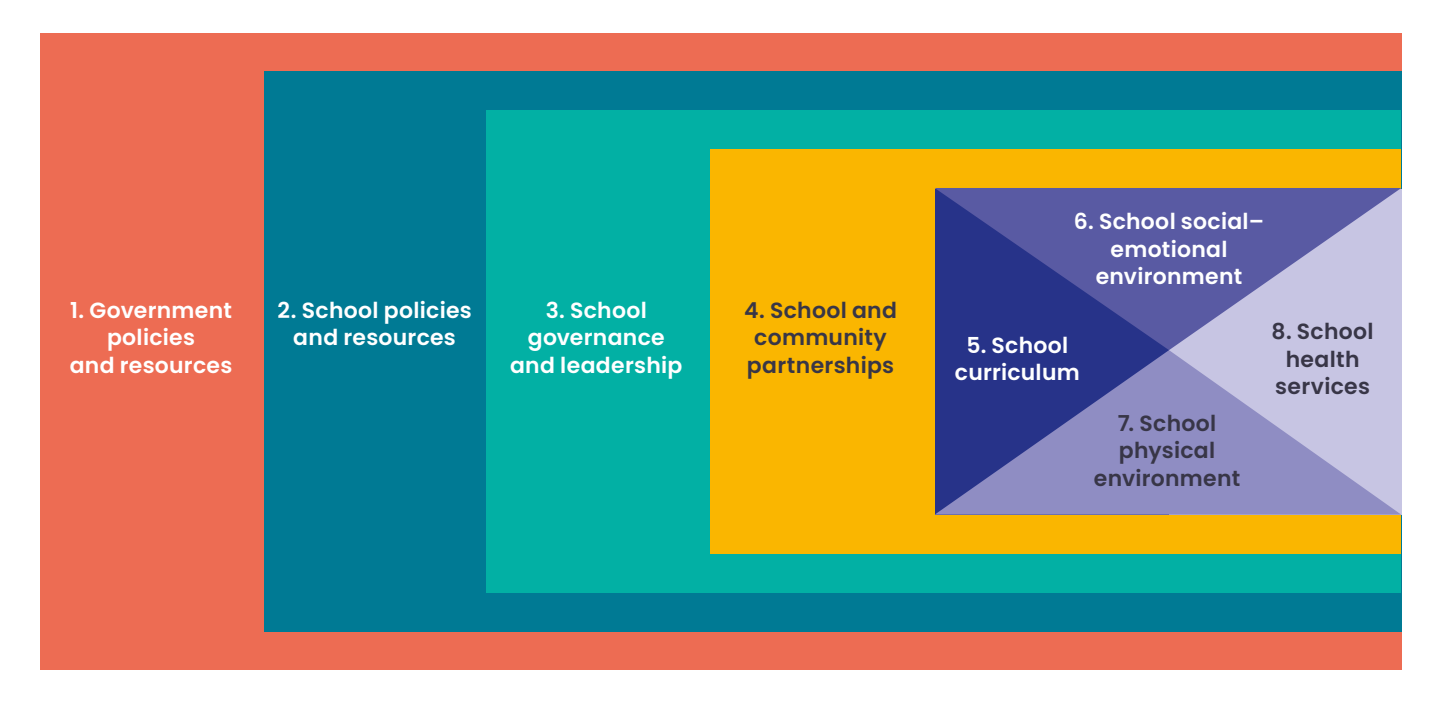
Fig. 1. The eight global standards for health-promoting schools and systems

As in this topic brief, the global standards are designed to be used by various stakeholders involved in identifying, planning, funding, implementing, monitoring and evaluating any whole-school approach (even if the term HPS is not used) at local, subnational, national and global levels, primary and secondary schooling and public and private educational institutions.